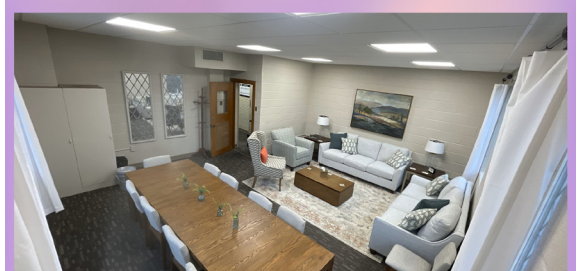
Special thanks to the PHUMC Memorials Committee for the furnishings provided for The Loft (Room 304). These gifts were given in memory of loved ones and to the glory of God.