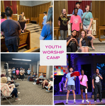
YOUTH WORSHIP CAMP

This month we held our third annual Youth Worship and Audio/Visual Camp! Students learned about leading worship, playing their instruments, the ins-and-outs of what it takes to produce a worship service, performed for Helping Hands, and had a lot of fun!