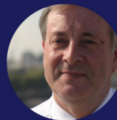
Dr. Alister McGrath