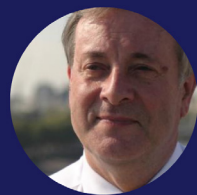
Dr. Alister McGrath