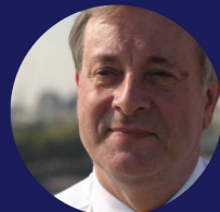
Dr. Alister McGrath