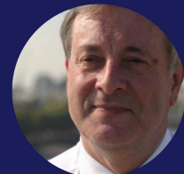
Dr. Alister McGrath

STAY TUNED FOR MORE INFORMATION. REGISTRATION OPENING OCTOBER 1.