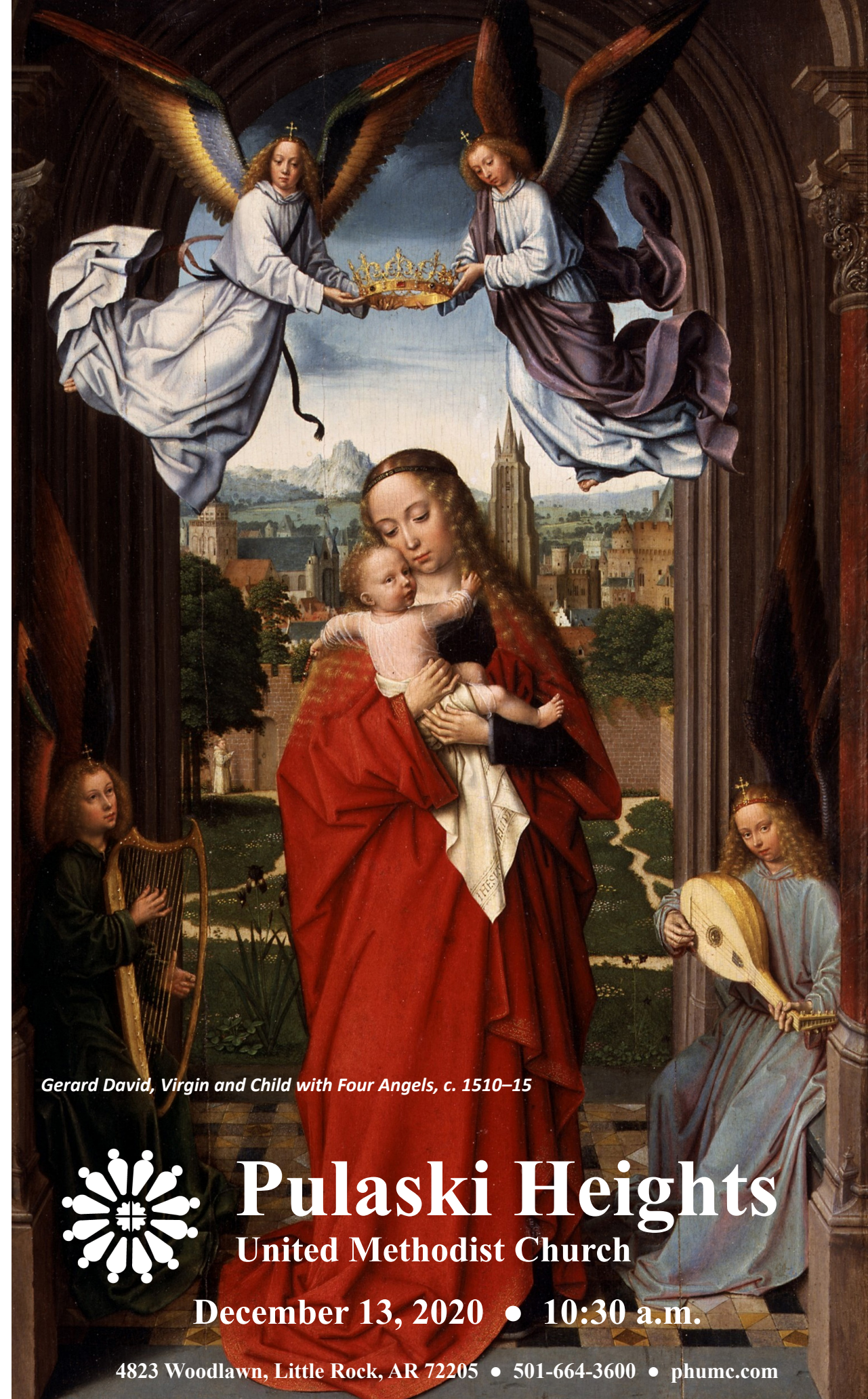
Gerard David, Virgin and Child with Four Angels , c. 1510-15

Musical texts are printed by permission of Church Copyright Licensing International #1544693.