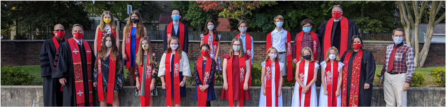
Members of 2020 confirmation class. Pictures from both confirmation services can be found on our Facebook page.