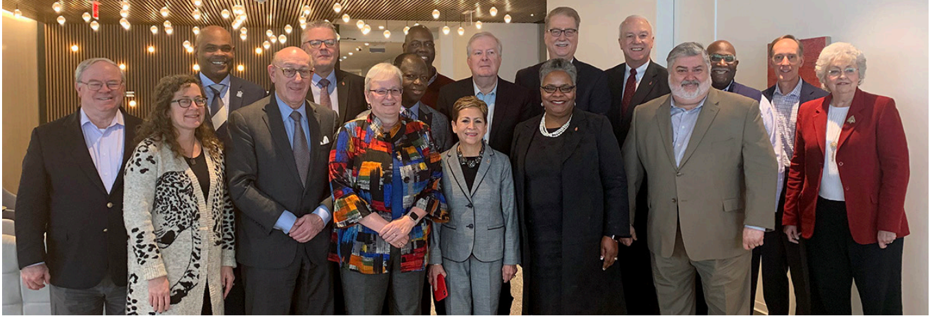
Members of a diverse group of bishops and other United Methodist leaders gather for a group photo in Washington after reaching agreement on a proposal that would maintain The United Methodist Church but allow traditionalist congregations to separate into a new denomination.

If you follow the news media, then you know a diverse group of sixteen United Methodist leaders recently negotiated a proposed protocol (plan) to essentially separate our denomination in a way that allows all parties to continue in ministry for Jesus Christ, according to conscience. This plan, along with others, will be considered at the next General Conference to be held in Minneapolis, May 5-15. While I don't like words like "divorce" or "division" and I prefer "marriages" that last a lifetime, still God is able to work miraculous things in challenging circumstances. This just may be one of those moments.