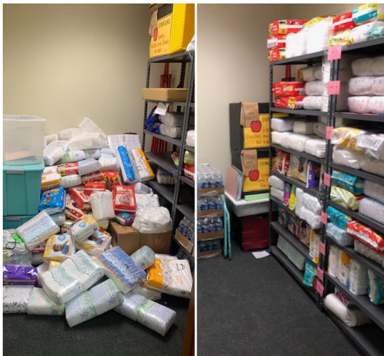
Diaper Bank before and after. Diapers will be distributed the first Wednesday of each month during food pantry hours.

The PHUMC Diaper Bank is a FREE community resource that provides diapers to families in need. Operating out of Pulaski Heights United Methodist Church, community members can apply to receive diapers. The Diaper Bank started with a successful drive last September that saw donations from our congregation totaling more than 10,500 diapers and 8,000 wipes. These diapers and wipes were donated to the St. Luke Children's Learning Center helping families in need.