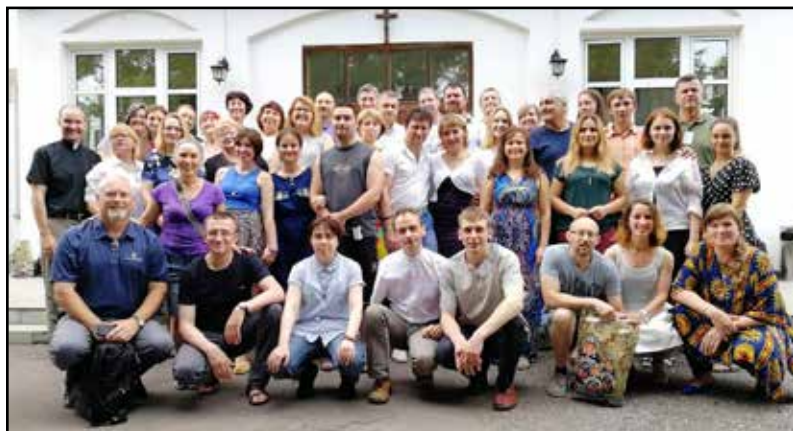
Pictured are the 2018 Summer Course students of the Moscow Theological Seminary.