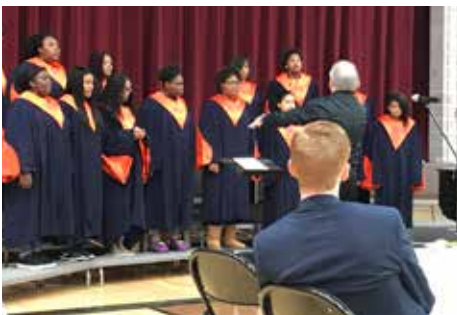
Hall High School Choir at the Primetimers Luncheon - April 26