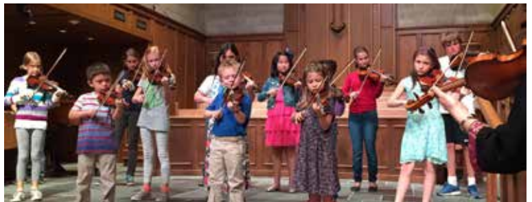
Adventures in the Arts students performing in the Sanctuary during the October recital.

Sign up by Connect Card during worship, phumc.com/cancerfriends , or call 664-3600 by Monday, November 9.