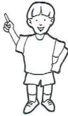
hold up one finger

God put one star God put one star In the sky. In the sky. Then He added many stars Then He added many stars In the sky. In the sky.