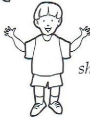
show all fingers