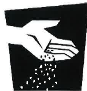
Mustard Seed Faith

The puzzle is based on Luke 17:5-10 (NIV).